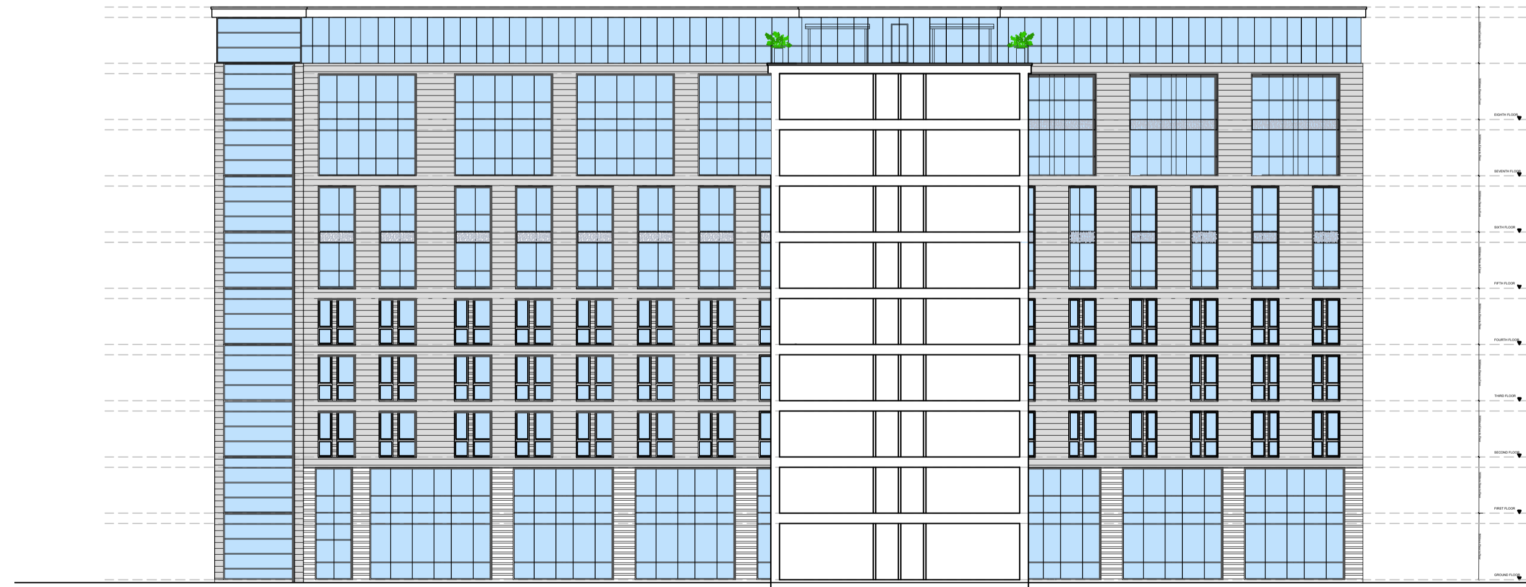
Proposed Elevation/ Section B-B Scale 1:200