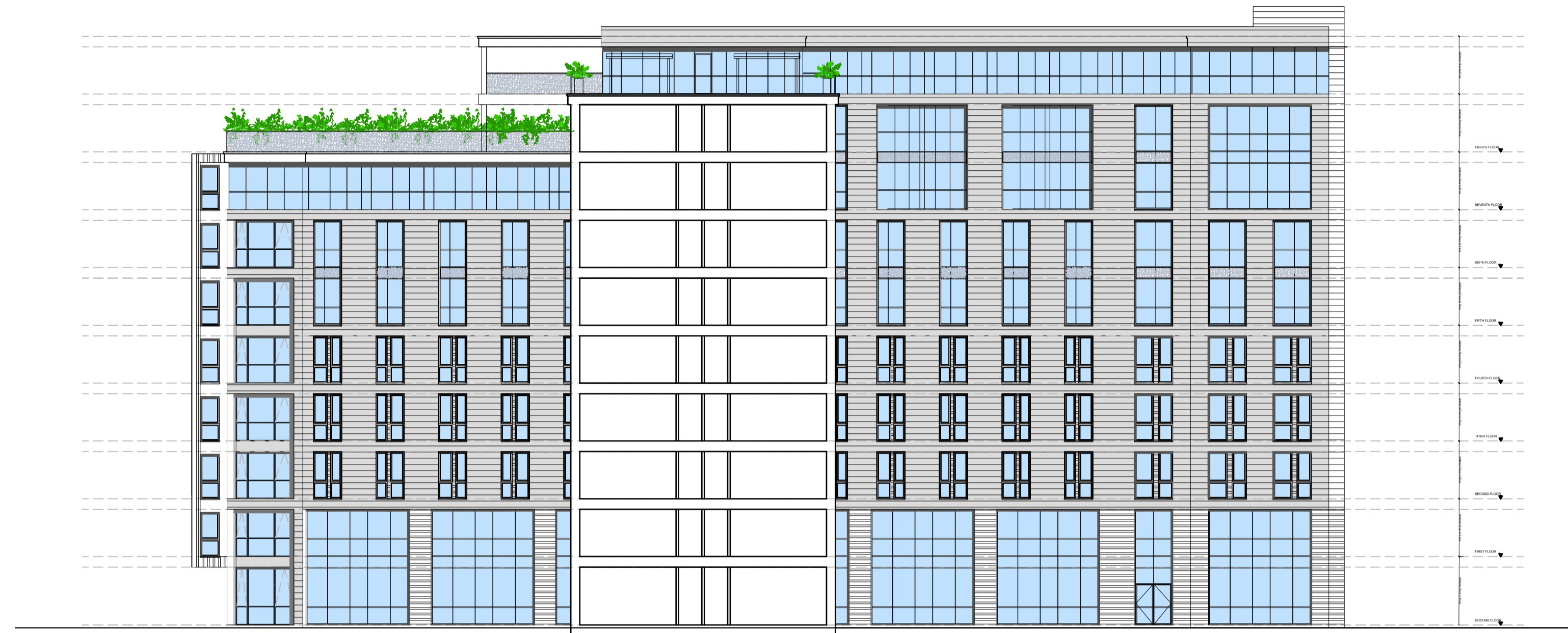
Proposed Elevation/ Section A-A Scale 1:200